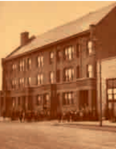
University of Chicago/ Mary McDowell Settlement House

b orn from the ideals for change of the Progressive Era, the School of Social Service Administration has been an advocate and resource for