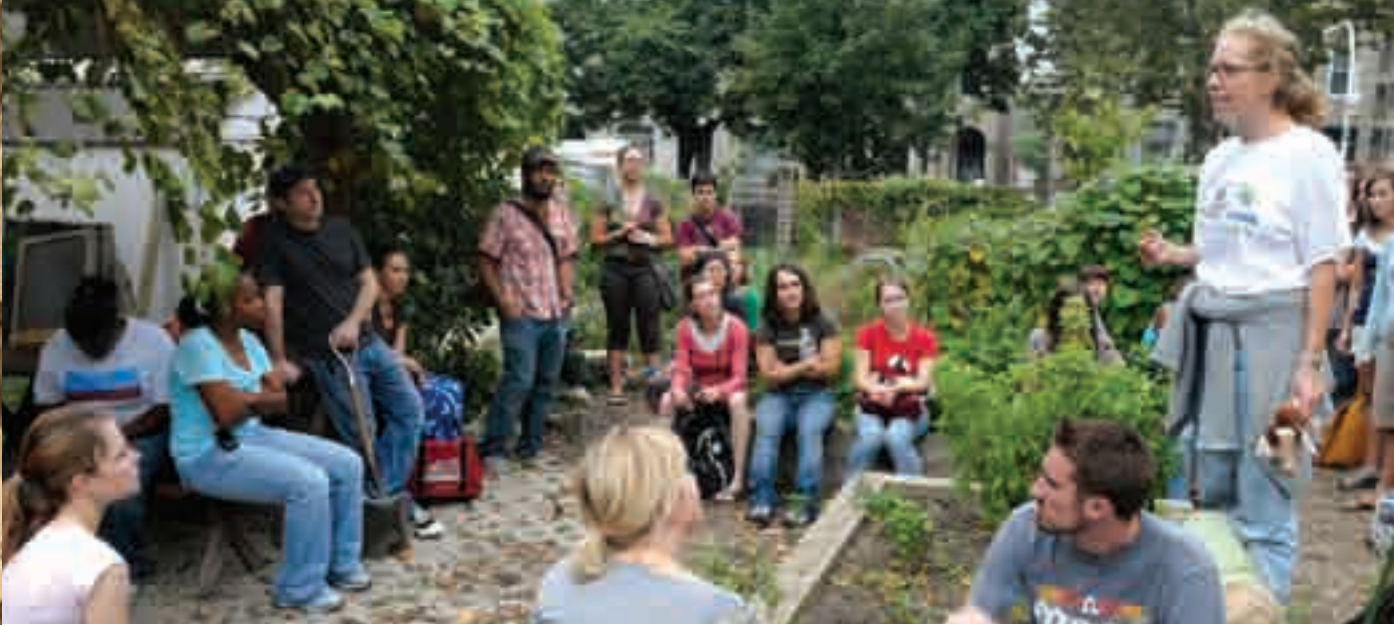
SSA students at the Brickyard Garden, a community garden project in Woodlawn, 2008