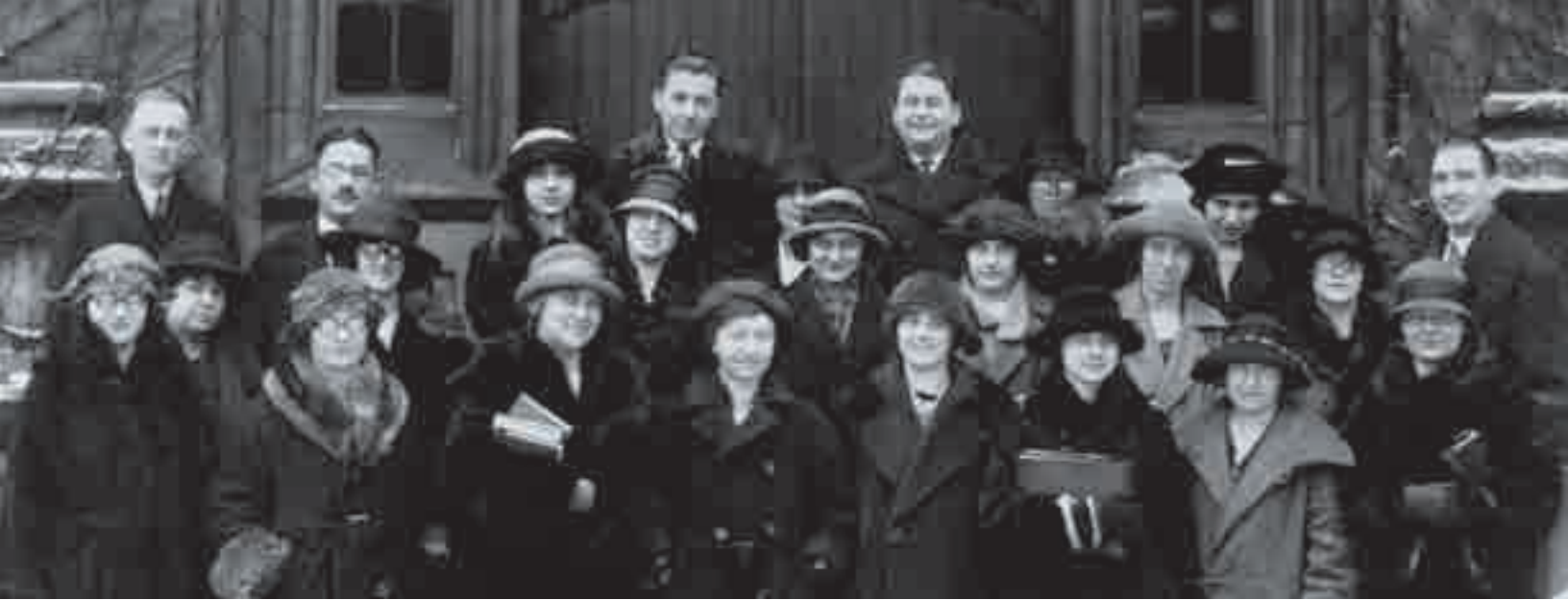
SSA Class of 1934