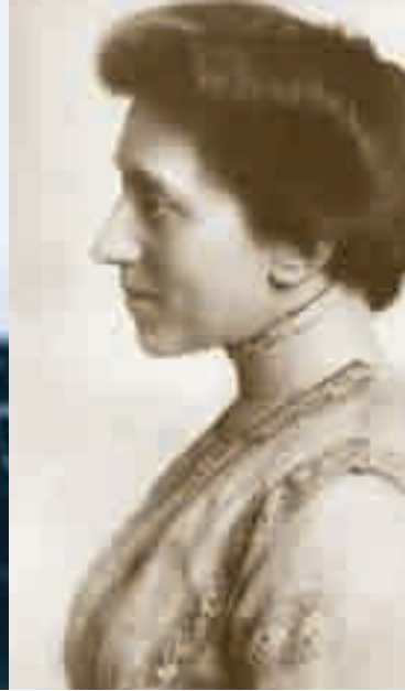
Founding mothers (left to right): Grace Abbott, Sophonisba Breckinridge with Marian Talbot, Edith Abbott, Julia Lathrop

Much of the early curriculum at the School pushed forward ideas of what social work could accomplish.